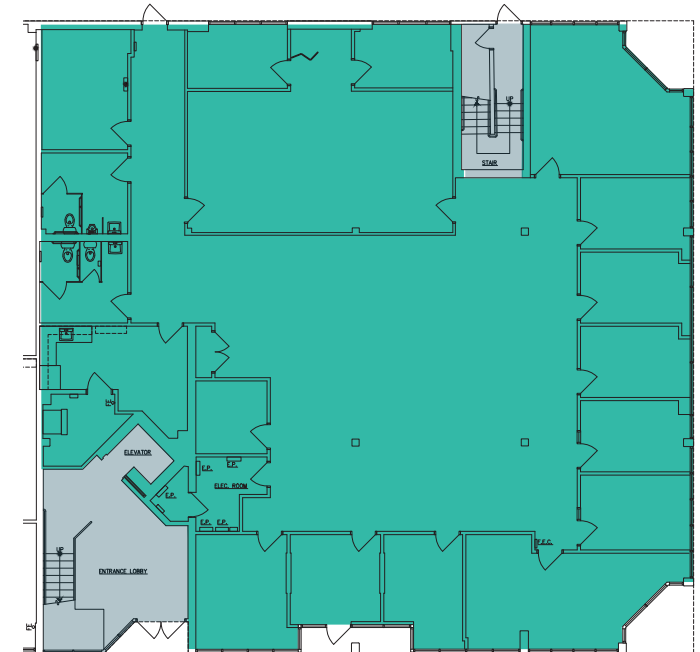
As-Is Floor Plan