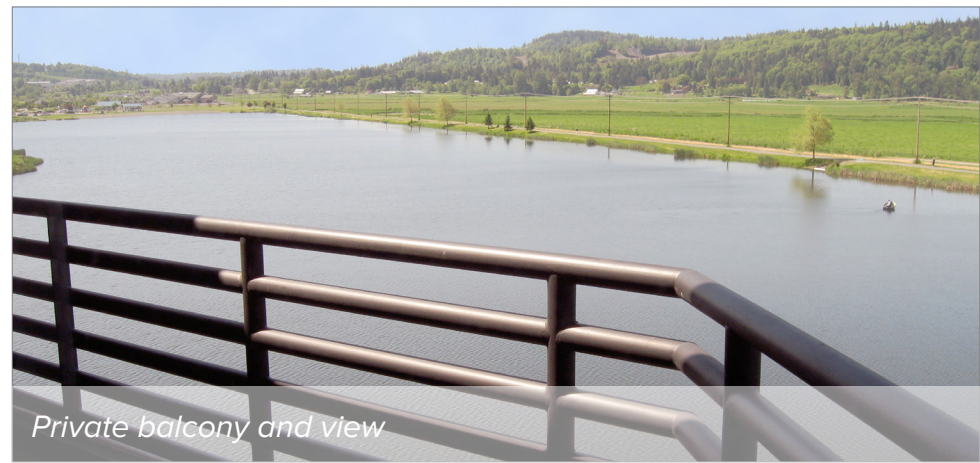
Private balcony and view