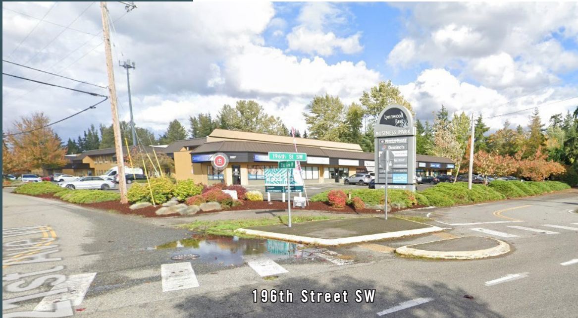
196th Street SW